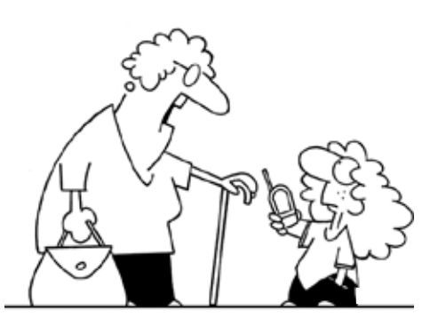
"Wireless communication is nothing new. I've been praying for 75 years!"