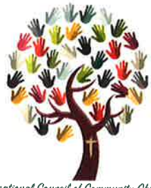
International Council of Community Churches