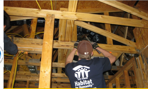
ICCC Volunteers Building a Home With Habitat For Humanity

As a fellowship of local churches and ministry centers, the Council thinks globally and ministers locally. Congregations share ideas and resources in developing ministries to those whom Jesus called "the least of these."