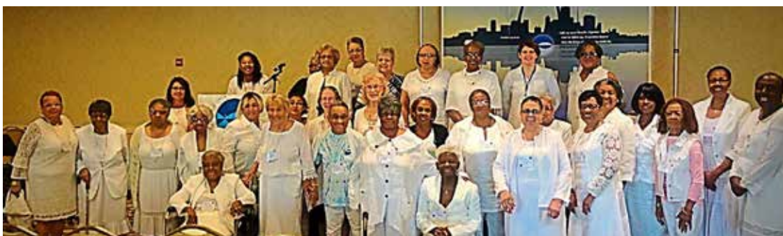
The ICCC WCF 2018 in St. Louis, MO