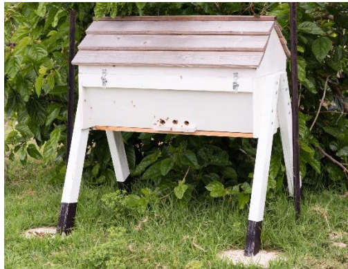
(A beehive in Burkina Faso)

To support the 2023 ICCC/WN Africa Project, please send your donation to the ICCC office.