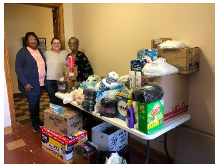
(Left is People's Community Church, Detroit, and right is Second Community Church, Columbus)