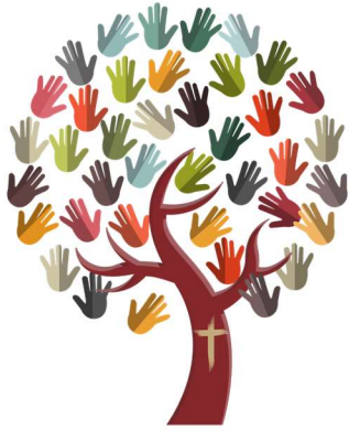
International Council of Community Churches