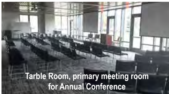
Tarble Room, primary meeting room for Annual Conference