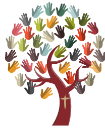
International Council of Community Churches