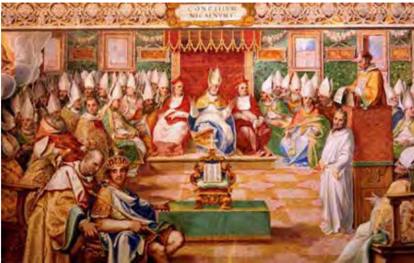
A fresco depicting the First Council of Nicaea in the Sistine hall of the Vatican Library.

May this season between Nicaea and Pentecost be a time for us to recommit to the hard and holy work of being the Church together. Not because we are the same, but because we belong to one another.