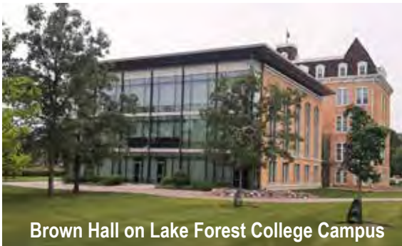
Brown Hall on Lake Forest College Campus

Most conference meetings will be held on the campus of Lake Forest College in Brown Hall. This century-old building has a new conference center attached with the latest digital technology and green design to respect God's creation. Our primary conference room, the Tarble Room, is a beautiful room filled with natural light, featuring windows on three sides and great views of the tree-lined campus. Brown Hall is surrounded by convenient parking and close to the Student Union, where the cafeteria offers three meals a day.